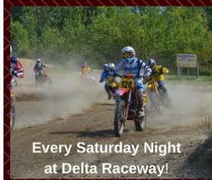
Every Saturday Night at Delta Raceway!