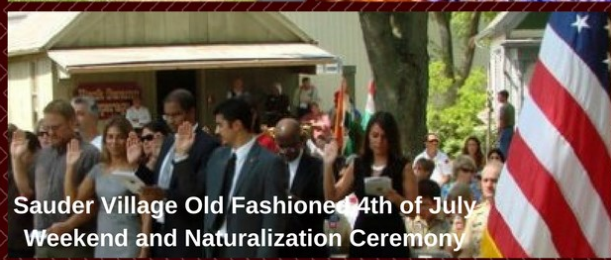
Sauder Village Old Fashioned 4th of July Weekend and Naturalization Ceremony